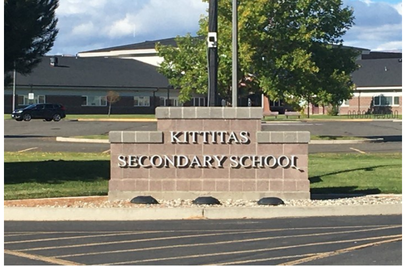
Kittitas, Washington

False reports from the Kittitas County Public Health Department on September 10 stated that an “uncontrolled COVID spread” threatened a 14-day closure of the Kittitas School District, whereupon radical teachers and administrators coerced a select group of students into mandatory COVID-19 testing on school property, with many children pressured to submit to testing without parent permission.