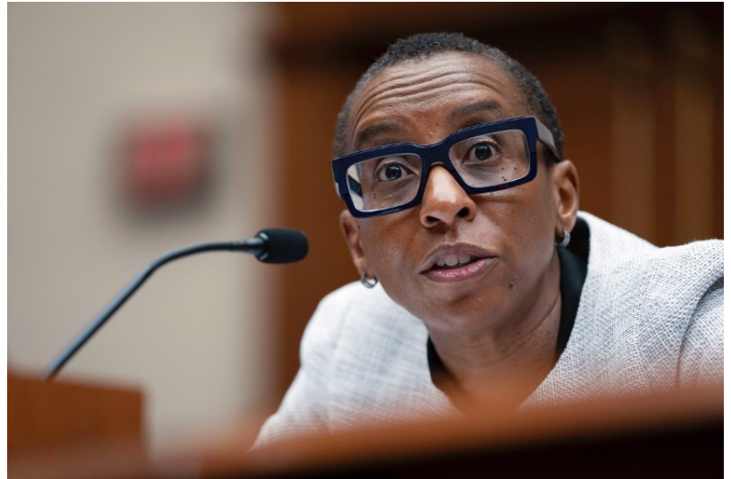
Claudine Gay

But dishonest scholarship mightn't be the only reason Gay resigned. She was also accused of not fighting campus "antisemitism" in the aftermath of the Hamas terror attack on Israel in October.