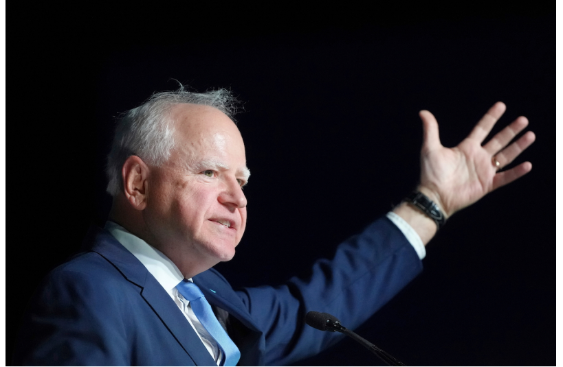
Tim Walz

Had Walz been elected vice president to far-left Democrat Kamala Harris’ president, he likely would have been compromised.