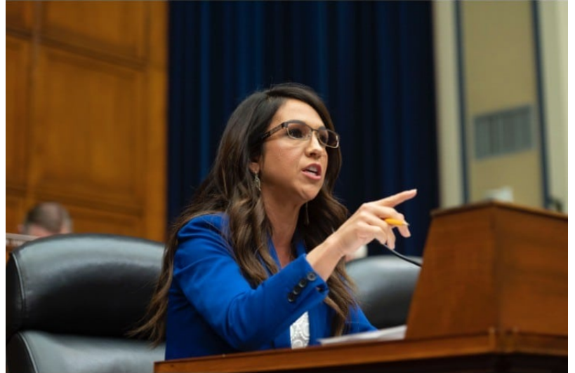
Lauren Boebert

The DCCC's "offensive target list" includes "competitive Republican-held or open districts across the country that are critical battlegrounds" where the House Democrat campaign arm will work hard to unseat "MAGA Republicans and win a Democratic House majority this cycle." Two of the seats targeted are held by the embattled George Santos (R-N.Y.) and firebrand Lauren Boebert (R-Colo.), who squeaked out a victory after a close recount last November.