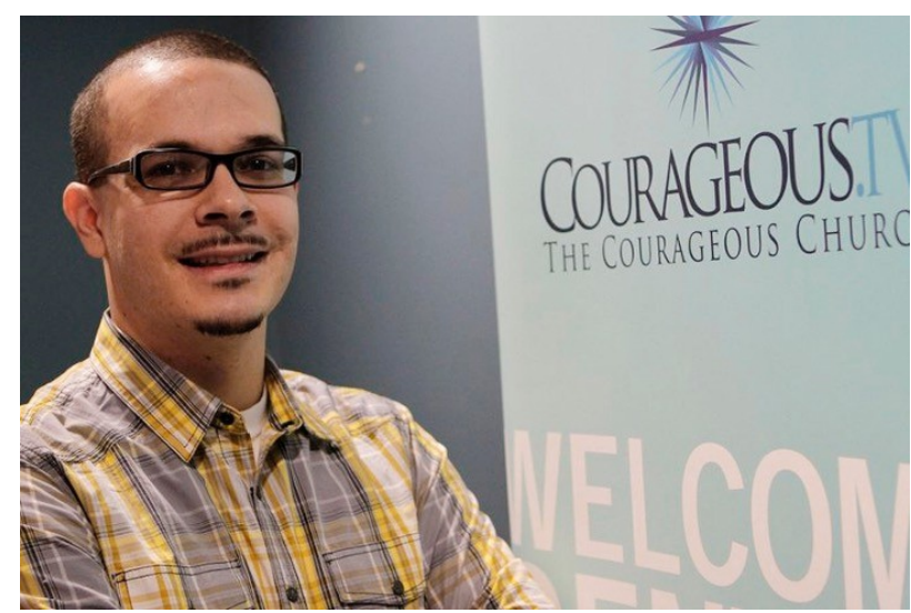
Shaun King

A report on the financial shenanigans in The Daily Beast is the third major black eye for an outfit connected to the bigger ongoing hoax called Black Lives Matter. In early August, King landed in hot water for purchasing an expensive dog with Grassroots Law funds. In late August, a lawsuit accused a top BLM leader of purloining $10 million from the BLM Global Network.