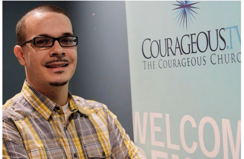
Shaun King

A report on the financial shenanigans in The Daily Beast is the third major black eye for an outfit connected to the bigger ongoing hoax called Black Lives Matter. In early August, King landed in hot water for purchasing an expensive dog with Grassroots Law funds. In late August, a lawsuit accused a top BLM leader of purloining $10 million from the BLM Global Network.