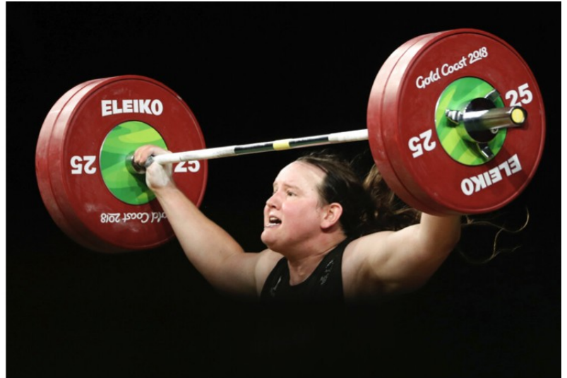
Laurel Hubbard

The petition began two years ago, but is quickly gathering signatures because "Laurel" Hubbard, a "transwoman," will represent New Zealand in Tokyo. Hubbard outlifted an accomplished woman to make the team.