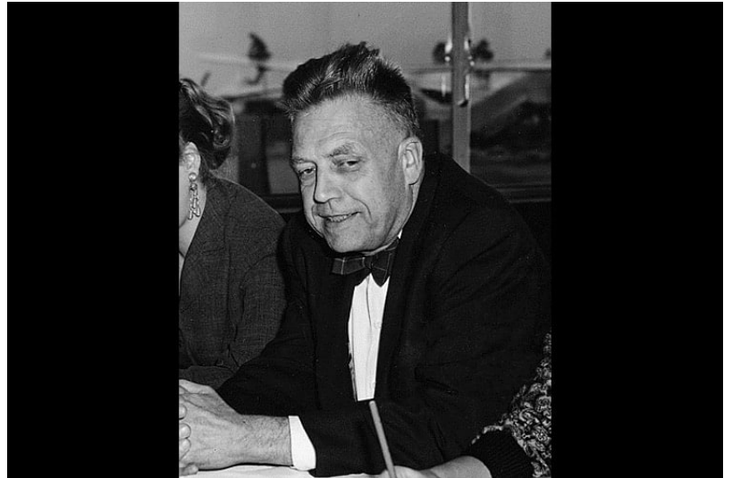
Alfred Kinsey

— James Russell Lowell, The Present Crisis , 1845