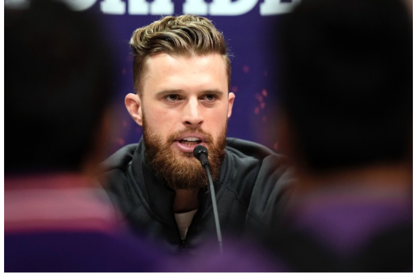
Harrison Butker

In a commencement speech at Benedictine College, a Catholic liberal arts college in Atchison, Kansas, Butker gave an unapologetic defense of traditional Catholic values. Butker lauded life and motherhood while deriding what he called "the tyranny of diversity, equity, and inclusion." Butker's Catholic honesty didn't sit well with the NFL.