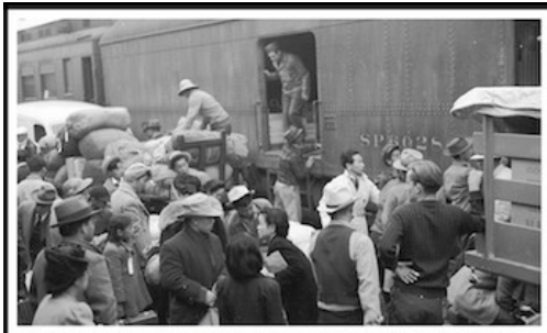
Above: Japanese Americans board a train bound for the Manzanar concentration camp where they will be interned during World War II. Below: A view of the Manzanar camp.