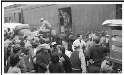
Above: Japanese Americans board a train bound for the Manzanar concentration camp where they will be interned during World War II. Below: A view of the Manzanar camp.