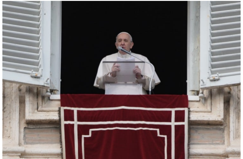
Pope Francis

But the document does much more than pulling the plug on a time-honored rite. It breaks even with recent Church history by giving his interpretation of the meaning of the liturgy, its efficacy, and “the art” of celebrating it. In its paragraphs, Francis appears in his characteristic role as the “pope of surprises.” We’ll take a look at some of them below.