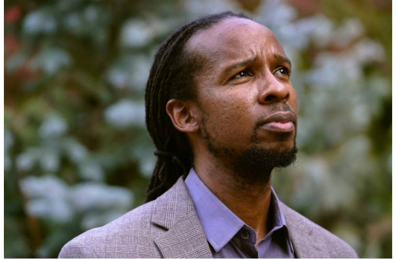
Ibram X. Kendi

“Never believe what you publish — and never publish what you believe,” said the sleazy journalist in the film Night Flier . This attitude could come to mind when pondering the new breed of “anti-racist” writers, such as Robin DiAngelo, who make millions peddling the narrative that American is a white-supremacist nation, whites are inherently “racist,” and preferential treatment for non-whites is “equity.” After all, do these rabble-rousing propagandists really believe all the nonsense they disgorge?