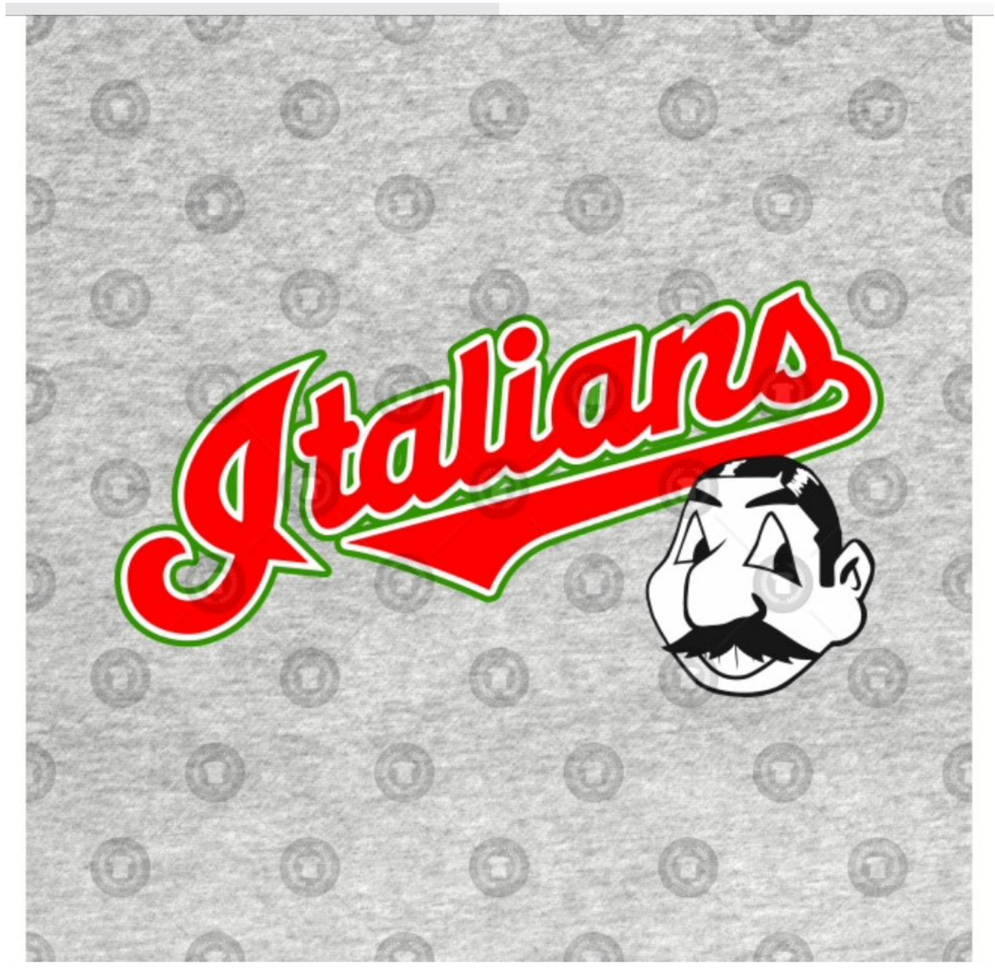
"Hey @Indians," she tweeted, "please consider this as your new logo/name. We are OK with it because we are not insecure activists. FYI NOBODY thinks of native Americans when cheering for our baseball team."

Hey <u>@Indians</u> please consider this as your new logo/name. We are OK with it because we are not insecure activists. FYI NOBODY thinks of native Americans when cheering for our baseball team. <u>pic.twitter.com/xsNosz2EuT</u>