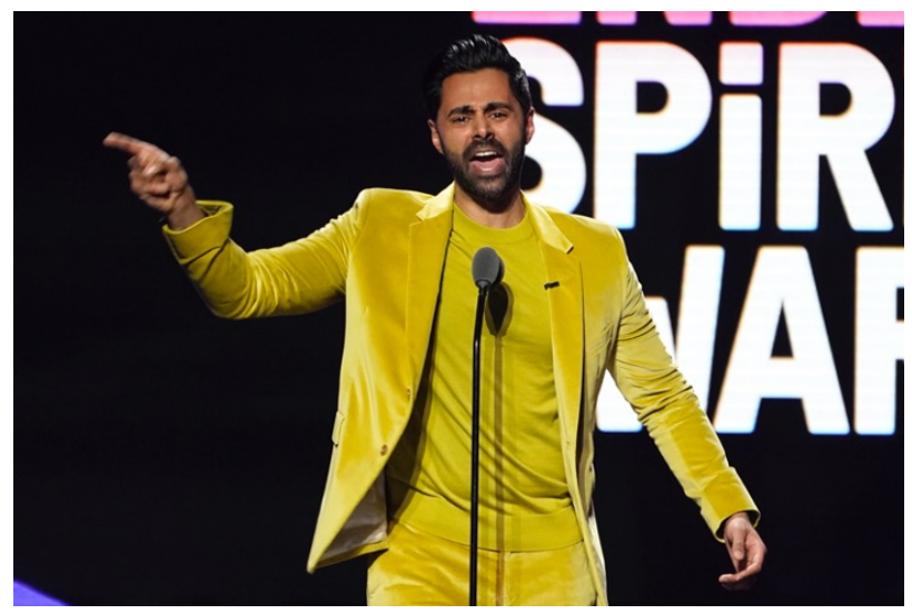
Hasan Minhaj

(Now, perhaps, we know what kind of "truths" Joe Biden referenced when he proclaimed, "We choose truth over facts.")