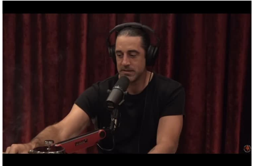
YouTube Aaron Rodgers

Prodded by Rogan about the NFL's one-size-fits-all approach to the Covid vaccines, Rodgers explained that the NFL actually sent people to training facilities to extol the virtues of the so-called vaccines to those who were on the fence about taking them.