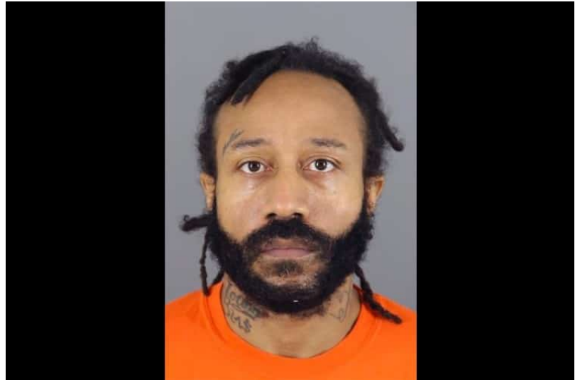
Darrell E. Brooks, Jr.

In other words, had Brooks been in jail where he belongs, he wouldn't have been able to mow down 53 people as he fled the scene of yet another crime. Five of those people are dead thanks to the leftists who run the Milwaukee district attorney's office.