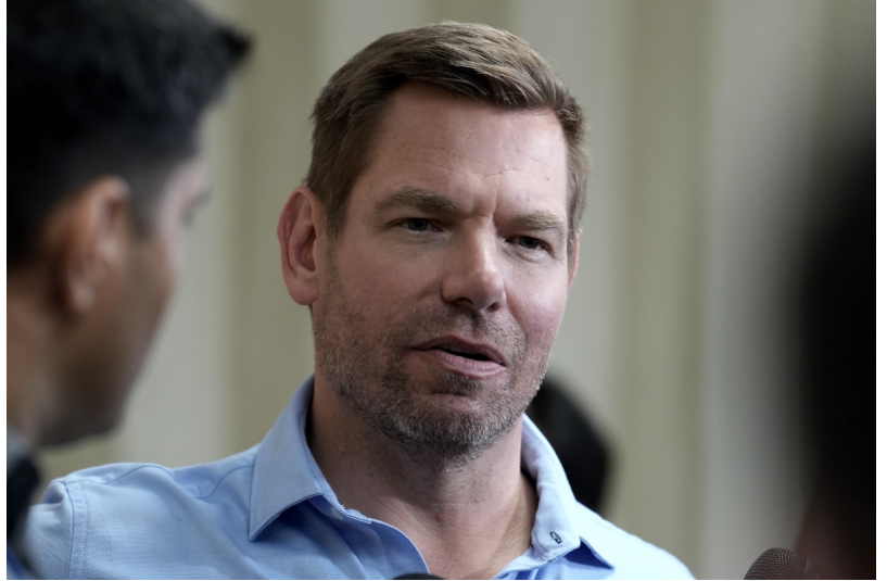
Eric Swalwell

One woman said Swalwell pressured for oral sex and raped her twice while she was drunk. He also sent pornographic Snapchat messages, the women alleged. Unverified video gone viral on social media purports to show Swalwell with a woman and another man on a bed.