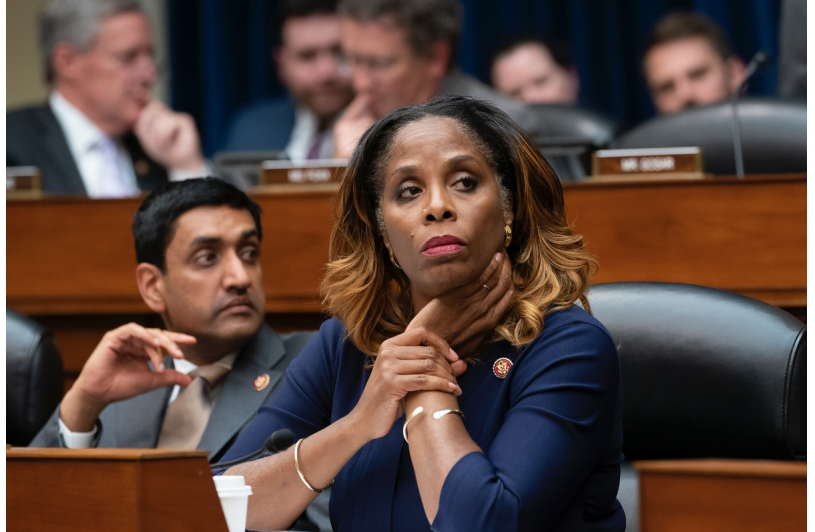
Stacey Plaskett

That means that Epstein, for all intents and purposes, asked questions of the witness, Michael Cohen, formerly President Donald Trump's attorney, who appeared before the Democrat-controlled House Oversight Committee. Plaskett, who received campaign donations from Epstein, was the dummy to his ventriloquist.