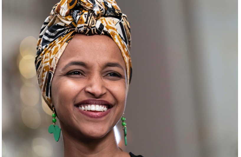
Ilhan Omar

Add to that the sudden closure of a “winery” that husband Tim Mynett owned that did not make wine.