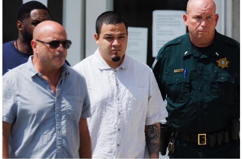
Kilmar Abrego Garcia (center)

An MS-13 gang member and wife beater, Garcia has been fighting to remain in the United States since his deportation in March, his June return to face the trafficking charges, and then the administration's plans to pack him off to Uganda.