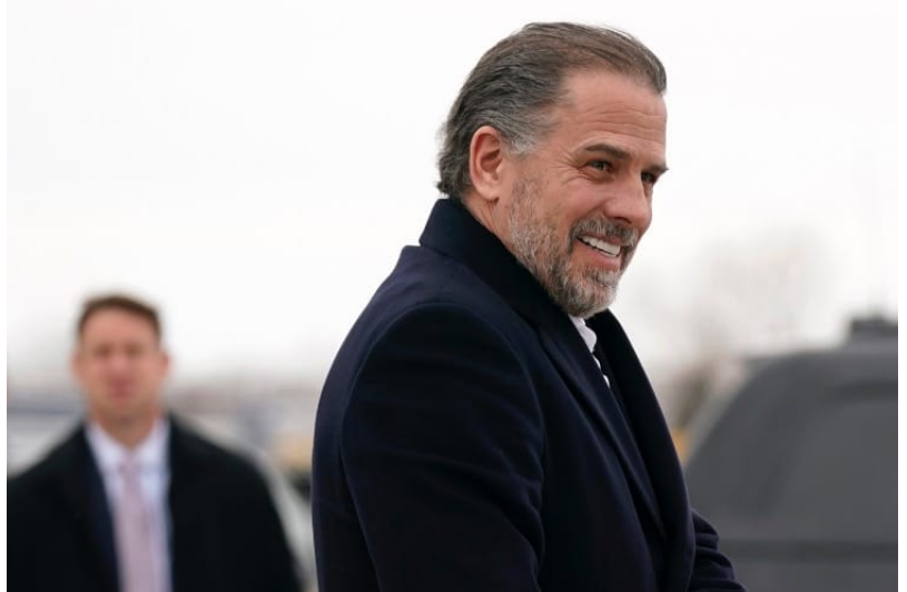
Hunter Biden

The second information charges the defendant with a firearm offense — namely, one count of possession of a firearm by a person who is an unlawful user of or addicted to a controlled substance.