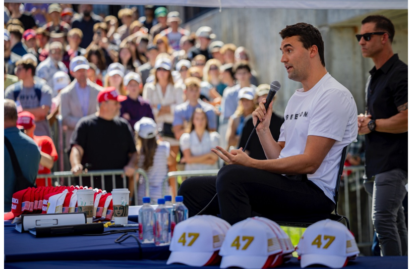
Charlie Kirk at Utah Valley University

In Arizona yesterday, at a packed memorial service, widow Erika Kirk forgave her husband’s murderer.