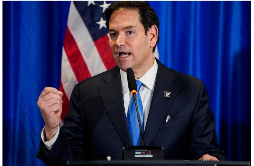
Marco Rubio