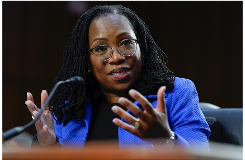
Ketanji Brown Jackson