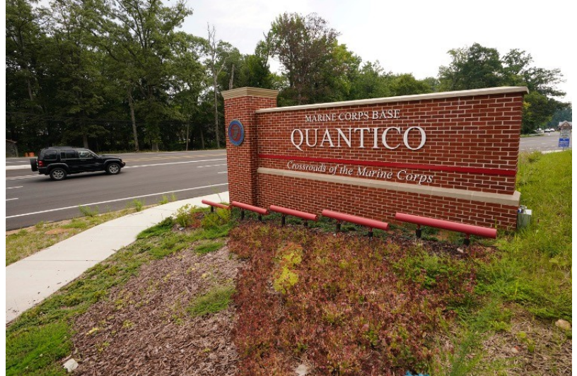
Marine Corps Base Quantico

Authorities have arrested two at Fort McCoy, and yet another in Montana is accused of rape. Child brides, another culturally enriching Afghan custom, have also shown up here.