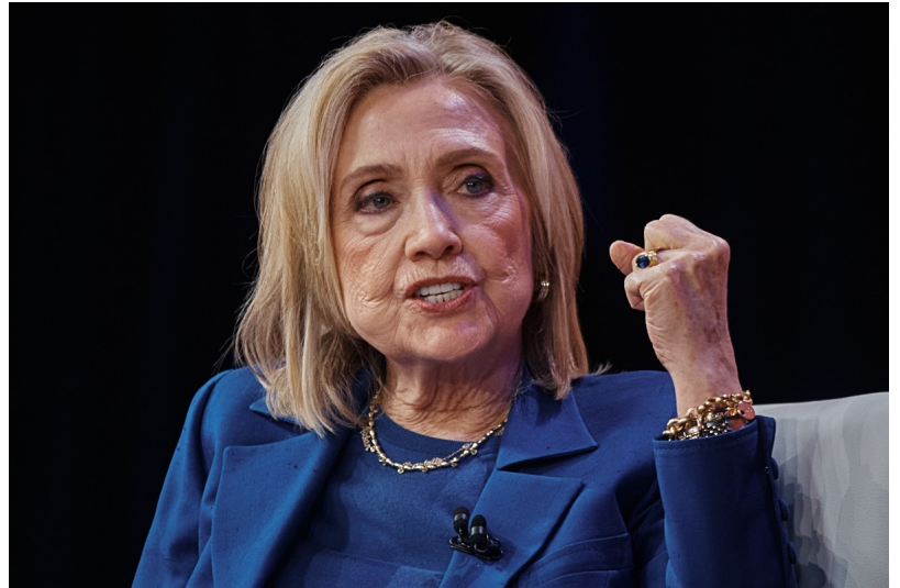
AP Images Hillary Clinton

And those doing the demonizing weren't just crackpots on TikTok. They were elected officials.