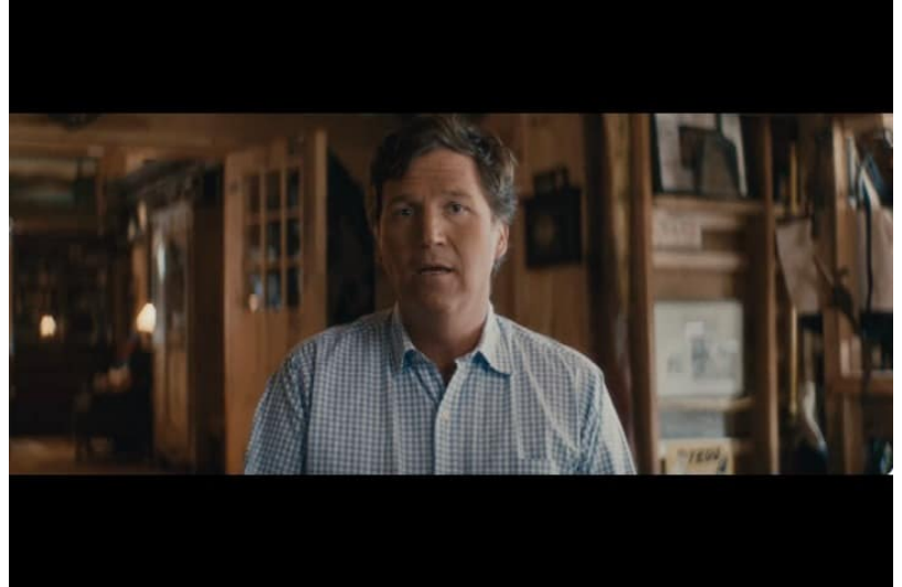
Tucker Carlson