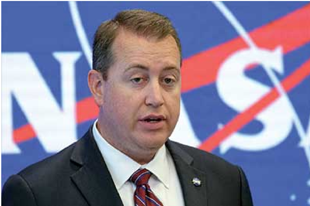
Jeff DeWit (AP Images)