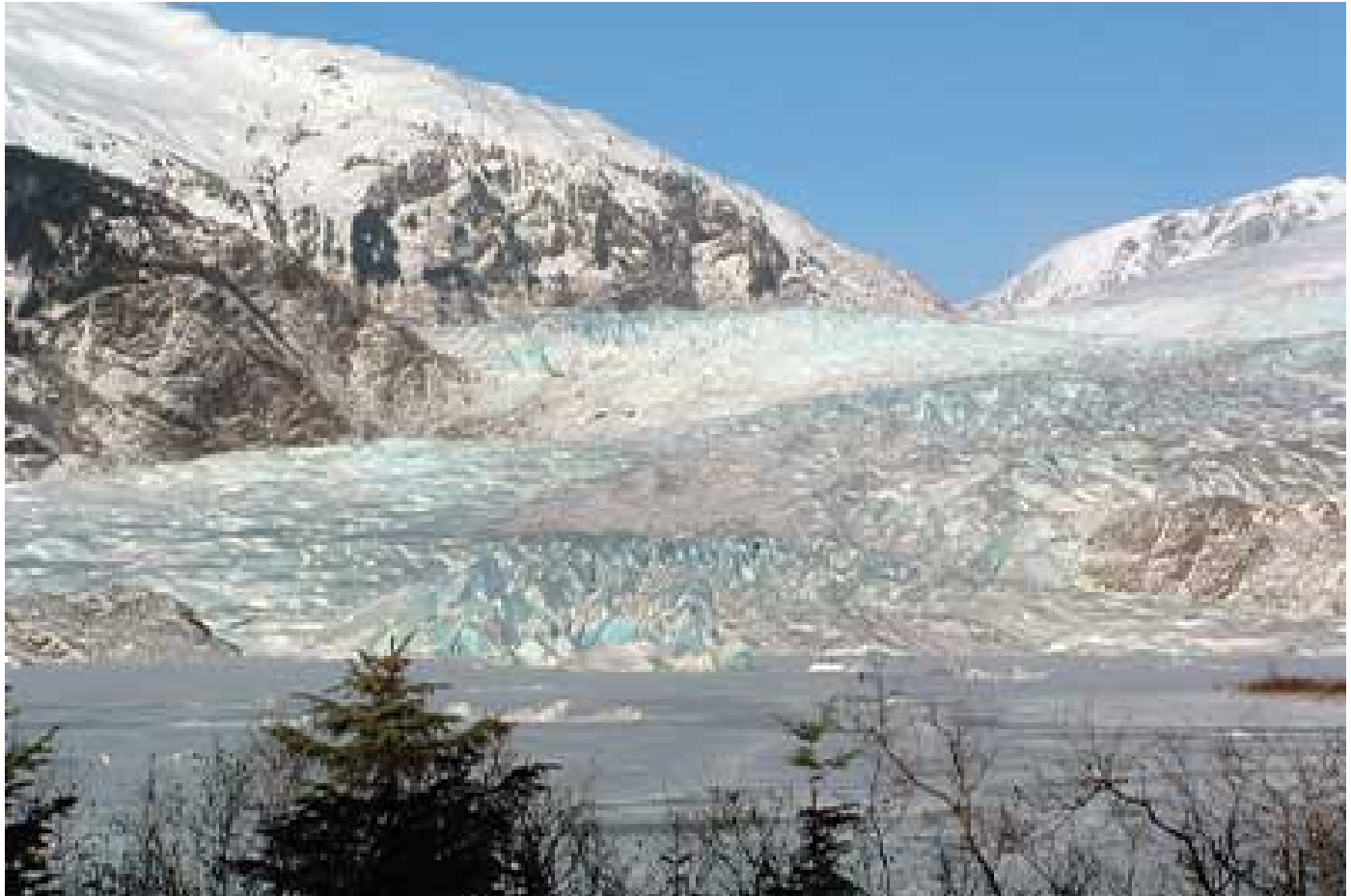
Mendenhall Glacier (Creative Commons Attribution-Share Alike 3.0)

Meanwhile, the landscape beneath receding glaciers bears witness to a time when temperatures were much higher. “Ancient trees emerge from frozen forest ‘tomb’” reads a 2013 Juneau Empire headline. “The Mendenhall Glacier’s recession is unveiling the remains of ancient forests that have remained frozen beneath the ice for up to 2,350 years.” Archeologists are discovering the same in many areas — boreal forests far above the current natural tree line. Are the trees “climate deniers” too?