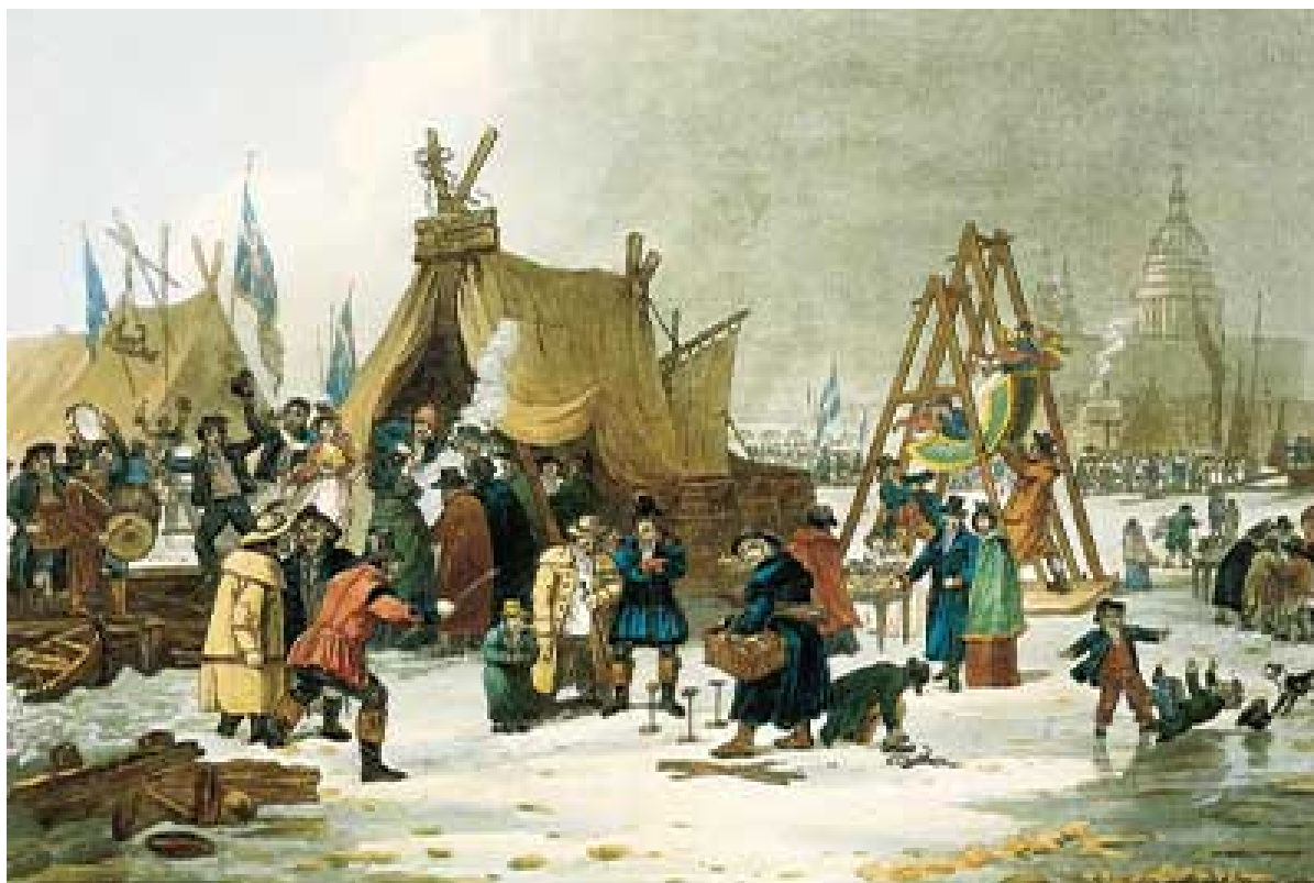
Thames River

Published in the January 29, 2024 issue of the New American magazine. Vol. 40, No. 02