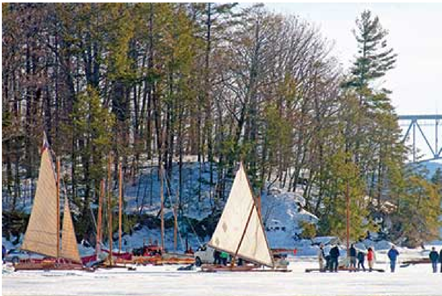
Ice yachting on the Hudson River

Published in the January 29, 2024 issue of the New American magazine. Vol. 40, No. 02