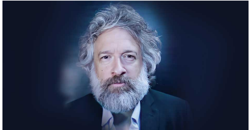
The New American