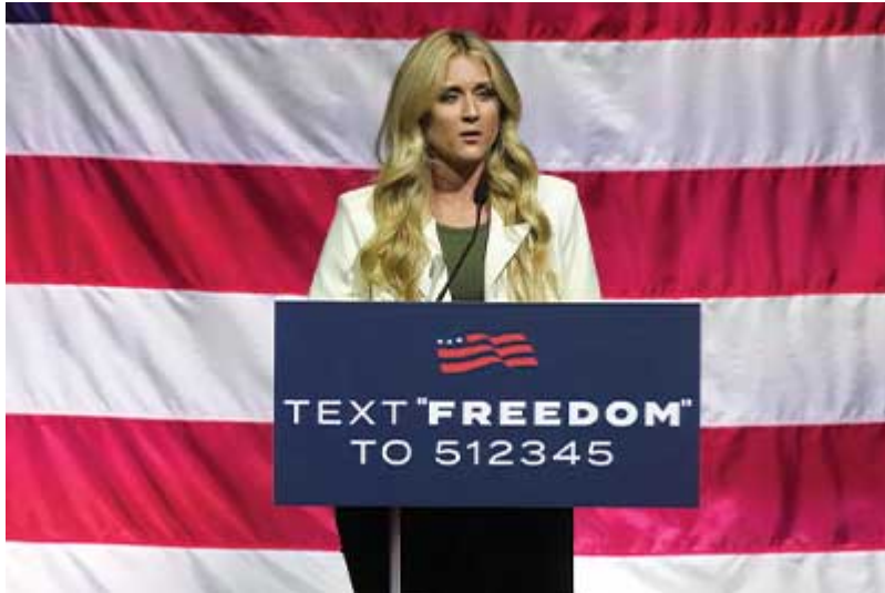
Riley Gaines