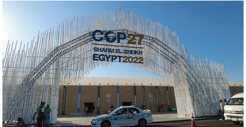
The New American

SHARM EL SHEIKH, EGYPT — The ridiculous circus music was stuck in my head almost from the moment I landed in Egypt, and it only got louder as the absurdity of it all reached unfathomable heights. You know the tune. If you had been there, you would understand why I couldn't get that outrageous melody off my mind. Everything was beyond ridiculous — it was surreal, starting from the moment I ran into the first COP27 officials who greeted the TNA team as we got off the plane.