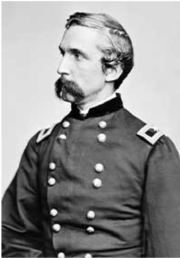
Joshua Lawrence Chamberlain

Published in the February 12, 2024 issue of the New American magazine. Vol. 40, No. 03