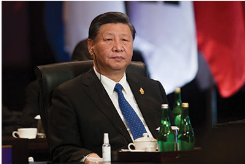
Xi Jinping

Eventually, Hamut and his family wound up in a Uyghur community in northern Virginia. As a result, five remaining relatives of Hamut and his wife were sent to reeducation camps in China, and only released in late 2019. Photographs of them, say the authors, evoke pictures of “Japanese POW camps or Jews rescued from Auschwitz, pale and gaunt.”