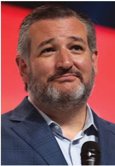
Ted Cruz

Published in the December 12, 2022 issue of the New American magazine. Vol. 38, No. 23