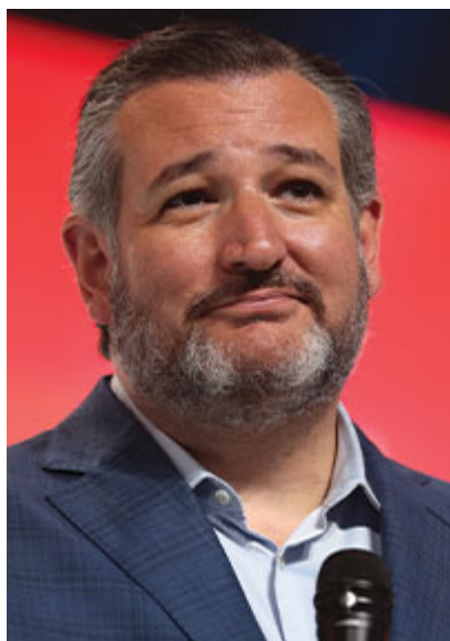
Ted Cruz

Published in the December 12, 2022 issue of the New American magazine. Vol. 38, No. 23