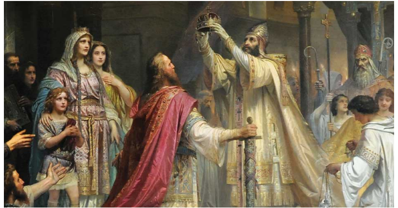
Friedrich August von Kaulbach Coronation of Charlemagne

On a fine spring day in April in the year 799, a colorful procession wound its way through the streets of Rome in honor of the Greater Litanies, the major rogation day in honor of all the saints. The procession included many dignitaries of the Holy See, including the pope himself, Leo III, who had risen from humble origins to become pope less than four years earlier, succeeding the aristocratic Adrian I. In his short pontificate, Leo had already made a powerful friend in the Frankish king Charlemagne, who had sent him a large trove of gold and a number of envoys, or missi dominici , who functioned as a papal protection detail. Besides his powerful Frankish ally, however, Leo also had powerful enemies. Most of them were supporters and relatives of his late predecessor, who regarded Leo as too common a man for the job, and wanted him replaced with one of their own.