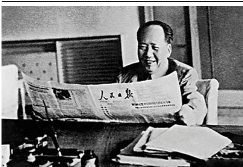
Mad Mao: Mao Tse-tung's "Great Leap Forward," which resulted in the deaths of tens of millions of Chinese, primarily by starvation, was a deliberate imitation of Stalin's "Great Turn."

Written by <u>Charles Scaliger</u> on May 20, 2022 Published in the June 13, 2022 issue of <u>the New American</u> magazine. Vol. 38, No. 11