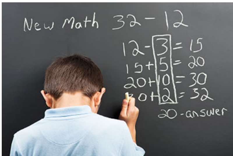
Figure this one out: The new Common Core math curriculum is virtually guaranteed to lower America's international standing when it comes to academic performance.

It's no longer possible to deflect by denial, insisting that radical, left-wing education reform won't happen in your schools or to your secure suburbs. It's not enough anymore to rationalize that you know a few teachers, and they would never do that to your school children. It's no longer sufficient for