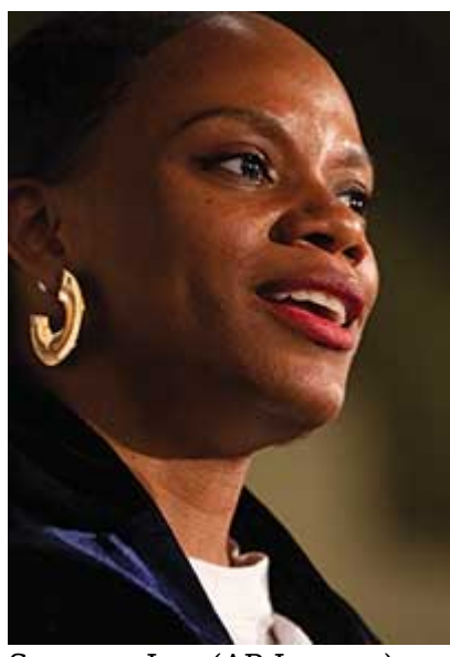
Summer Lee