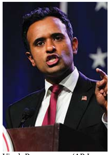
Vivek Ramaswamy