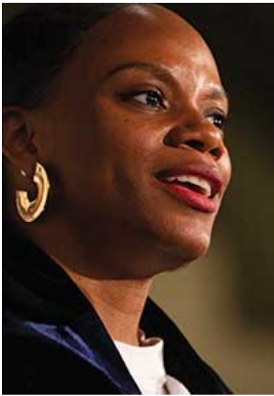
Summer Lee

Published in the August 28, 2023 issue of the New American magazine. Vol. 39, No. 16