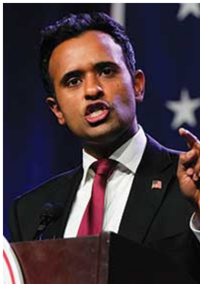
Vivek Ramaswamy