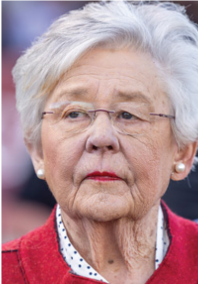
Kay Ivey

Published in the November 13, 2023 issue of the New American magazine. Vol. 39, No. 21