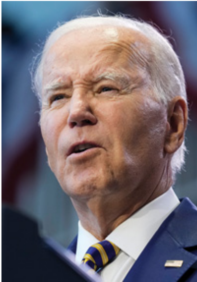
Joe Biden