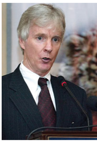
Ryan C. Crocker

Published in the September 20, 2021 issue of the New American magazine. Vol. 37, No. 18