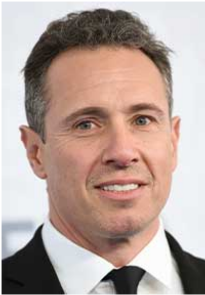
Chris Cuomo