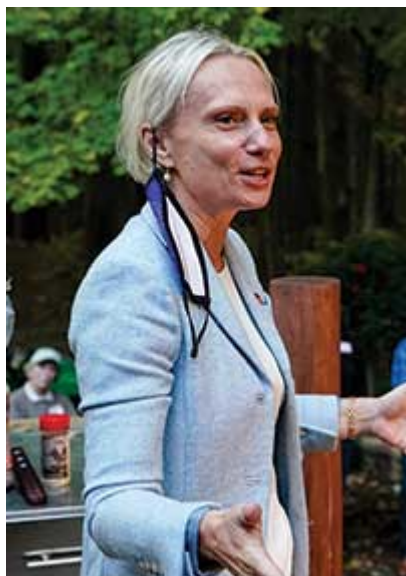
Victoria Spartz

Appearing on Steve Bannon's War Room podcast, former Trump attorney and current RNC senior counsel for election integrity Christina Bobb discussed April's Arizona grand jury indictment that claims she tried to overturn the 2020 election. If convicted of the nine felonies listed, she said, "I assume it would be the rest of my life in prison."