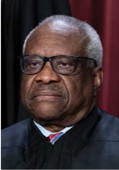
Clarence Thomas