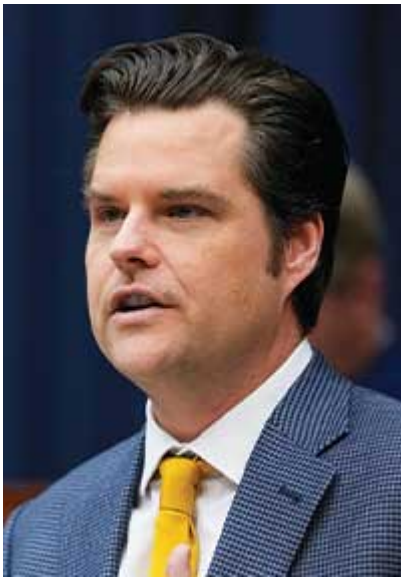
Matt Gaetz

Published in the July 31, 2023 issue of the New American magazine. Vol. 39, No. 14