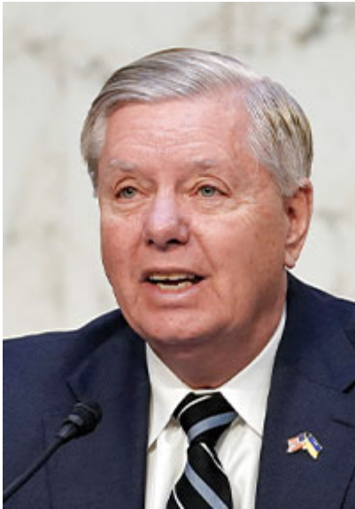
Lindsey Graham