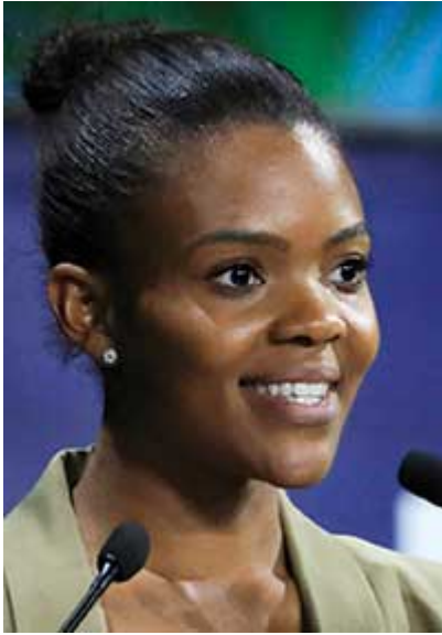
Candace Owens

Published in the July 17, 2023 issue of the New American magazine. Vol. 39, No. 13