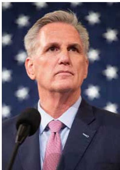
Kevin McCarthy (US House of Representatives)