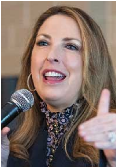
Ronna McDaniel