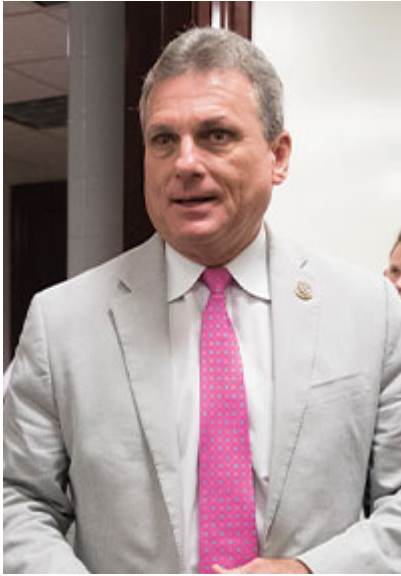
Earl Carter (AP Images)

Published in the April 10, 2023 issue of the New American magazine. Vol. 39, No. 07